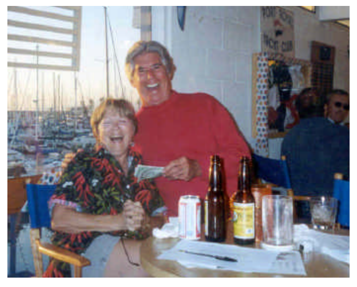
Superbowl 2002 Winner