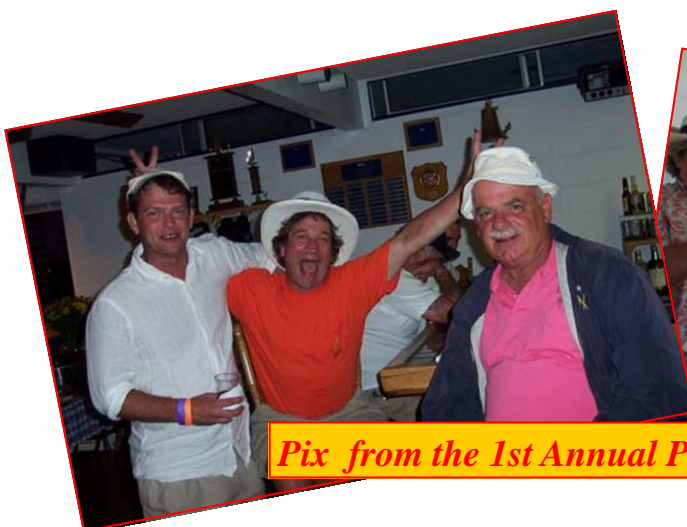
Pix from the 1st Annual Plastic Clas-