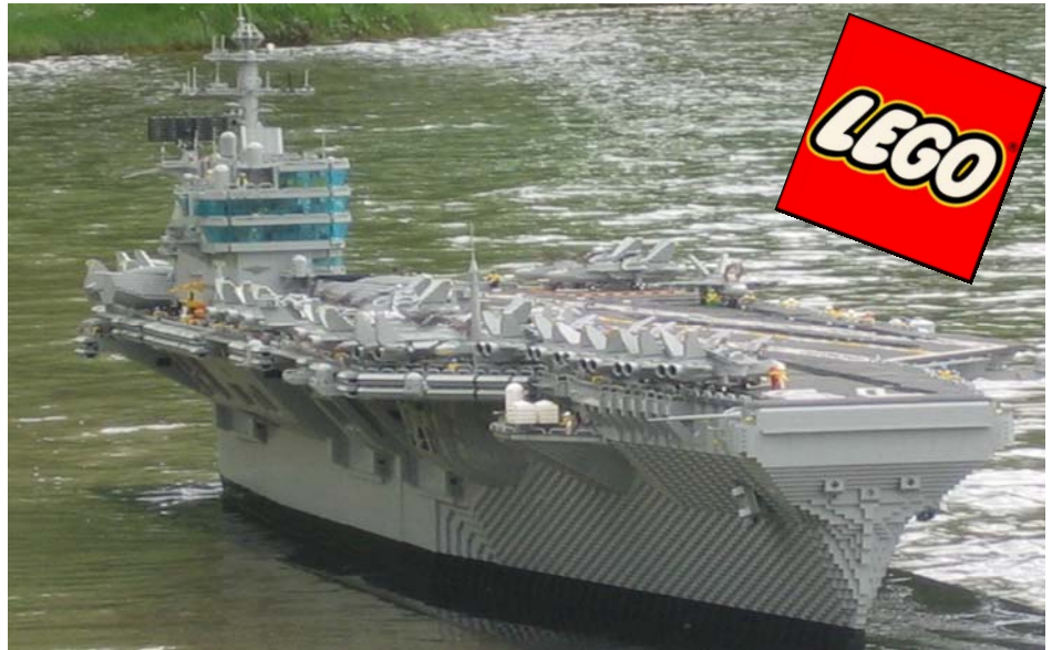
This is actually an aircraft carrier made out of LEGO!! Built by Malle Hawking, it is 5m long, 1.4m wide and 1.2 m high. It contains over 200,000 bricks and took a year to complete.