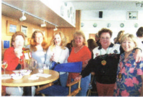
The Girls of PRYC