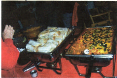
This is what it's all about