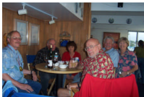
The Usual Suspects