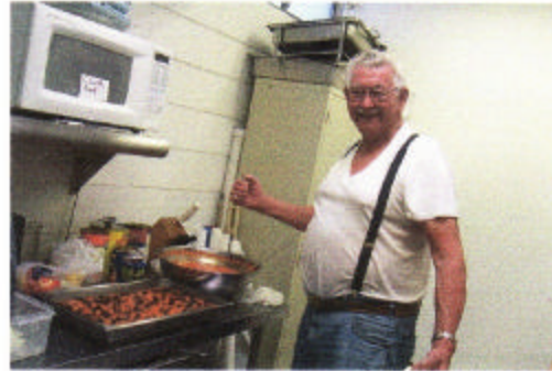
Beverly hillbilly at work