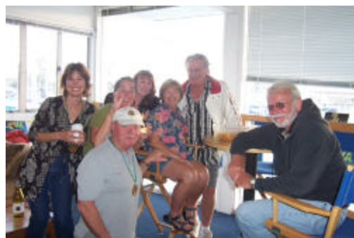
...while others play