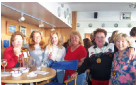
The Ladies of the Club